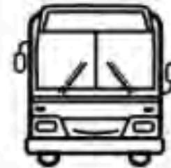
Switch to mass transit