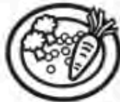
Eat less meat worldwide