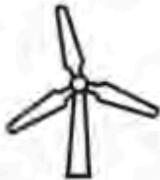
Build more wind farms

There's no single solution for climate change, but there is one that would be more effective than others. What do you think it is?