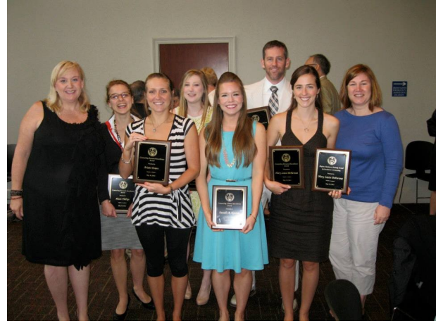
College of Social Sciences Honors Convocation May 10, 2013