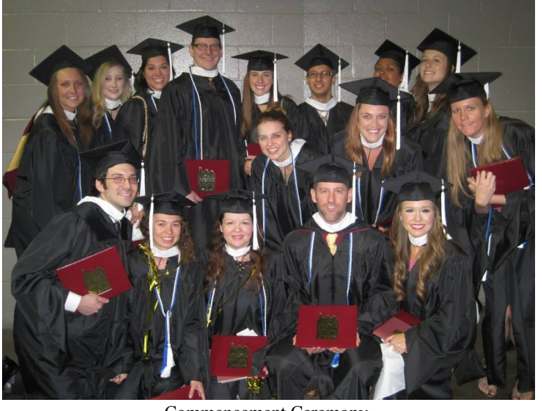
Commencement Ceremony May 11, 2013