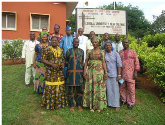
Current LIMEX Students in Benin City, Nigeria.

The proceeds from the campaign will purchase much-needed books for LIM students in Nigeria.