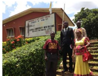
Students in Benin City, Nigeria, in front of the building they converted for use as LIMEX classroom space.

positions. Not all are willing to acknowledge the status of the lay baptized as priest, prophet and