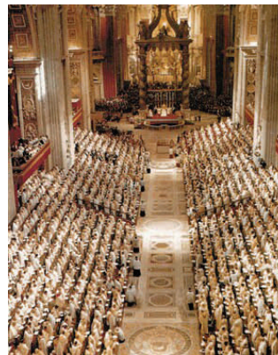
11 Oct. 1962: Opening Session of Vatican Council II at St. Peter's Basilica.

Catholic Youth Ministry held in Orlando. LIM's booth there was