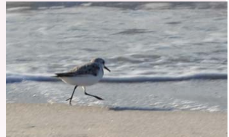
A sanderling on the Florida coast.

Local Jesuit Volunteers (JVs) dramatized the seventh station by focusing on environmental degradation, and they did so in part by reading Mary Oliver's "Poem of the One World": "This morning/ the beautiful white heron/ was floating along above the water/ and then into the sky of this/ the one world/ we all belong to/ where everything/ sooner or later/ is a part of everything else/ which thought made me feel/ for a little while/ quite, beautiful, myself."