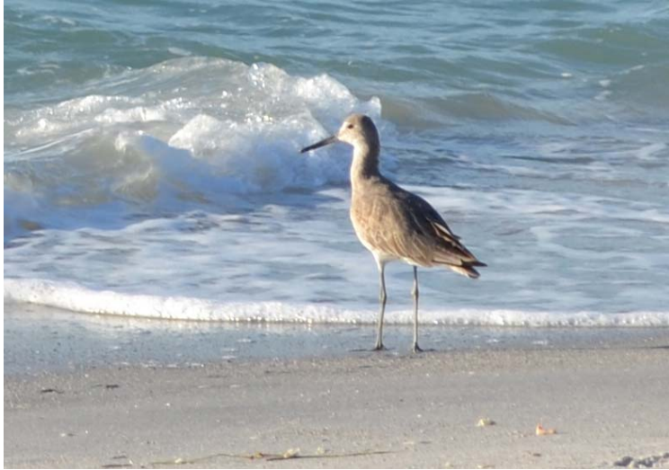
Photo of a willet on the Florida coast.