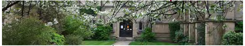
A view of Harris Manchester College at the University of Oxford.